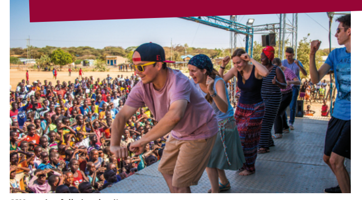
SIM getting fully involved!