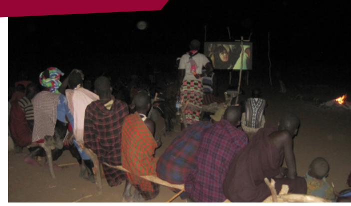
Showing the Jesus movie