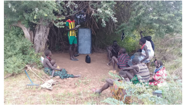
One of the newly formed small groups

Phase 5 (from 2019): Work continues at a high level. Mission candidates from Turkana, Kenya are accepted for start-up work.