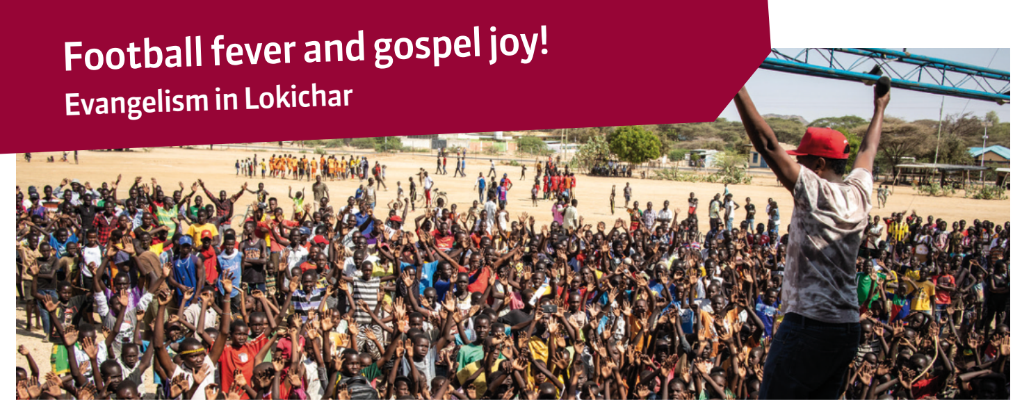
Everyone came to the football tournament to watch the games and listen to our message.