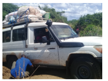
Challenges on the way