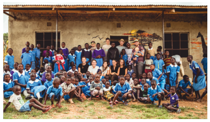
Doing a variety of activities with the children at a local school.