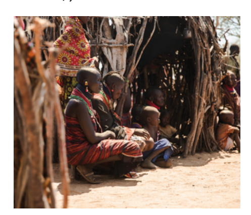
SIM in a Turkana village

I'm really so thankful that I was able to experience all these things within a secure framework of the SIM family.