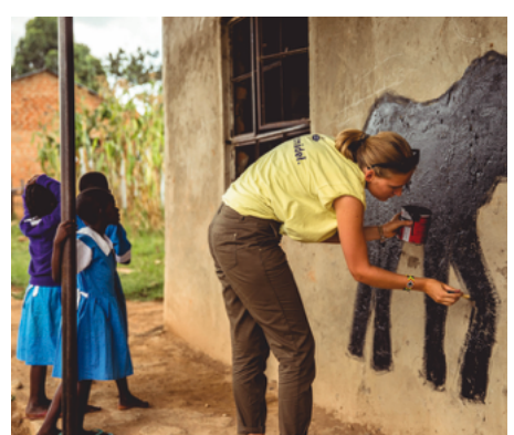
Painting a local primary school