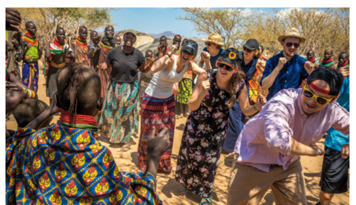
Dancing with the Turkanas.