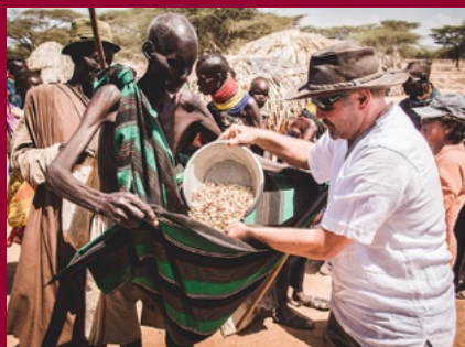
Eating is essential! Turkana food outreach.