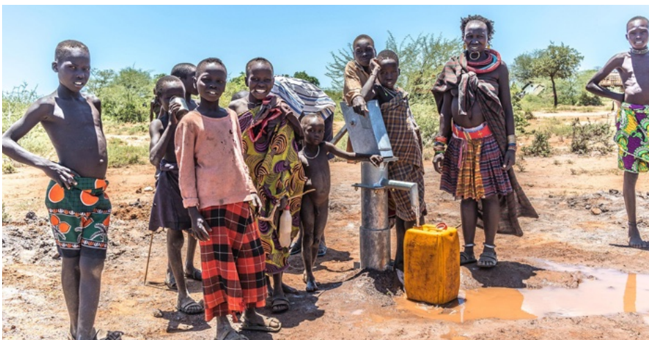
Six more wells are now being drilled in South Sudan

GFI is working along side "International Aid Service" to drill six more bore hole wells along side these fellowships to ensure access a safe clean and reliable source of water. IAS has already put in 2 wells and God willing many more will be completed soon! In this way, with the discipleship work and community development work these communities will be transformed for the better. Giving them a great outlook for their future.