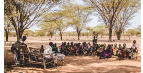
Preaching under attack!