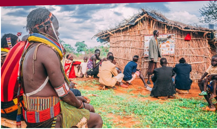
The Toposas listen to the Bible stories with excitement