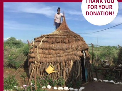
A temporary house for staff until the new buildings are ready in South Sudan.