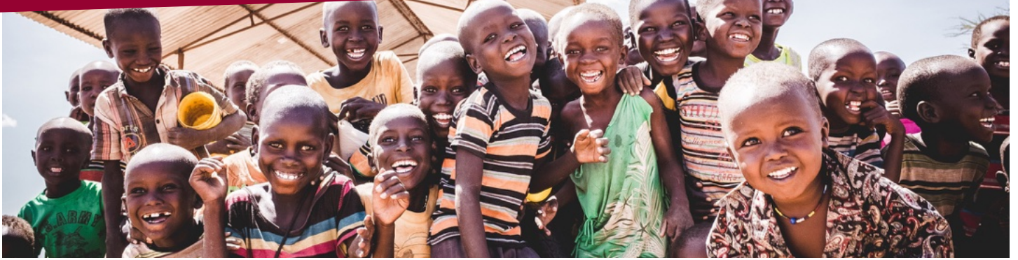
Children excited to see foreigners for the first time, and maybe even hoping to get a few sweets!

“If you can survive in South Sudan, you survive anywhere in Africa,” the GFI technical director said to me after I decided that I would pay a visit to South Sudan. When we left early in the morning, I couldn’t imagine what would actually await me. After only two hours of driving we were stopped by a policeman who wanted to arrest me, (my first experience of this in Kenya) because I was transporting too many people in the truck. On the way to the prison cell, my Kenyan colleagues were able to persuade the police to give me a break and prevented my first visit to prison in Kenya. It took a lot of negotiating skills and grace from God. At the border between Kenya and South Sudan where there had been tribal conflicts for decades, the exact boarder line had not really been drawn. In fact it is still being clarified, another new experience for me. This area is called no man’s land, where there is no