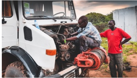
The engine being overhauled on the field