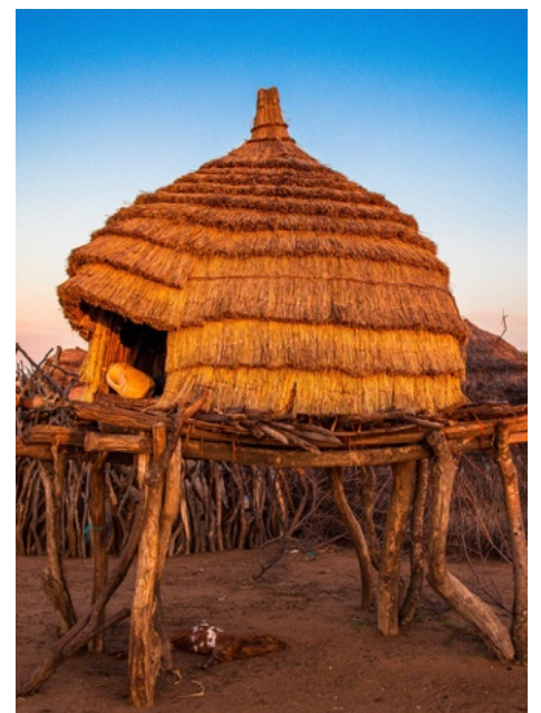
A typical Toposa house