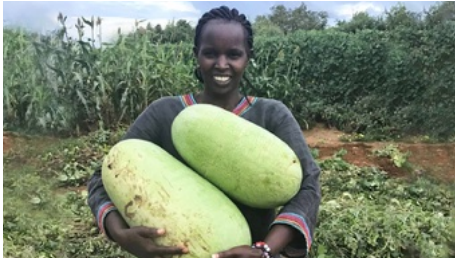
The land is fertile and the harvest is great