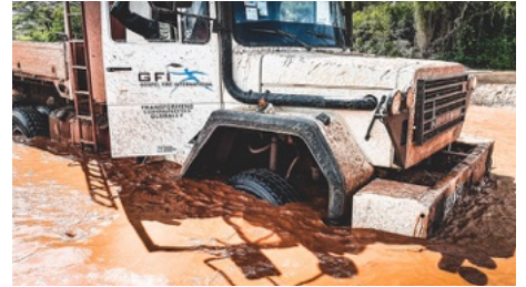
A slash flood hitting our truck

School: Another project we are working on in this area to transform this society is the school project in Naliel. The primary school students in Naliel had to hold their classes under trees for a while before a small and simple classroom was built for them, unfortunately in June during a strong storm this simple structure was blown away by the wind. We are currently in the process of putting up a new tin roof structure so that the children can have a better learning environment.