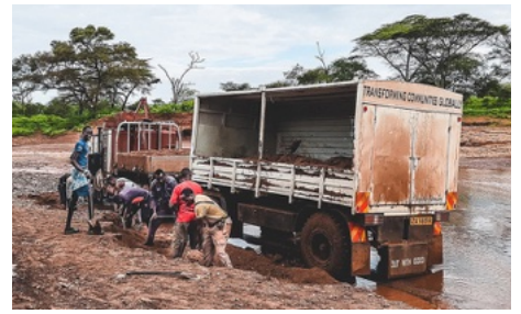
The new trailer has proven itself already!