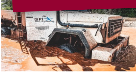
The door is wide open!