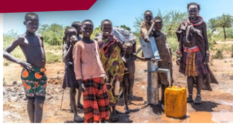
Water bringing new life!