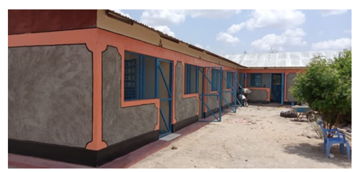
Welcome to the new guest-house