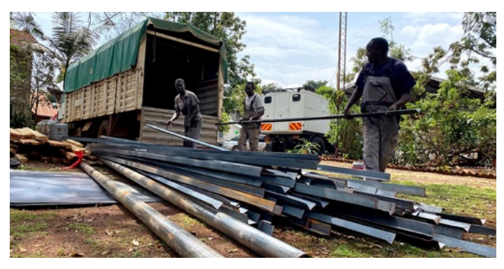
All material for the construction for the fence, toilets, cesspit and guest house were purchased in Kenya then transported by truck for three days to South Sudan.