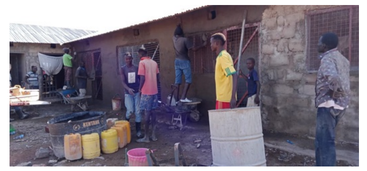
Completing the conference centre with guest rooms

Now we have to build some wash rooms to compliment the accommodation. Building in Sudan is very expensive as we have to transport all the building material from Kenya, including all the labours! We look back and praise God for how far we have come with this base and all that has been accomplished so far !