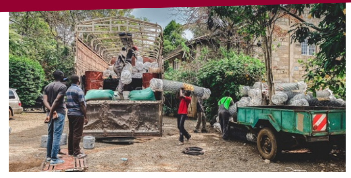
The material to build the fence is being loaded in Eldoret and transported to our station in South Sudan.

hile the world was busy with the pandemic this last year, we were able to complete the guest house at our base in South Sudan, complete with eight bed rooms and a small conference room. Naliel has now become a well-known place in Eastern Equatoria, as guests from Kenya, Uganda, Europe and America come to stay on a regular basis!