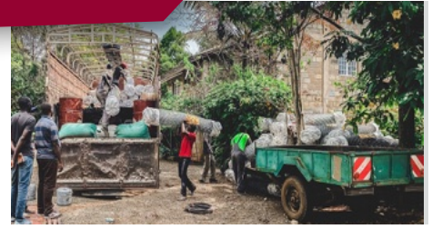
The construction of the base in South Sudan is progressing!

Eight people from unreached tribes now at bible school in Eldoret ! 2