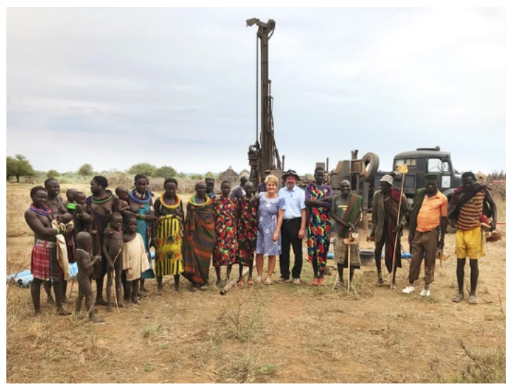
Praise God we were able to drill another well

become more and more dangerous. Every third person in the tribe own not only a rifle, but also assault rifles. Often the young warriors don't come back because of this and die somewhere in enemy territory. This is also the reason why there are many more women than men in these cultures.