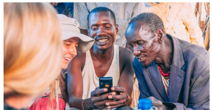
The chief hearing the word of God in his own language for the first time.