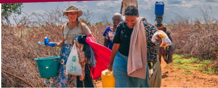
Walking to the well to wash dishes is a daily chore but it is also a chance to wash cloths and have a bath. (with some spectators)

This June we had a team from YWAM F&F South Africa on outreach with us for a few weeks.