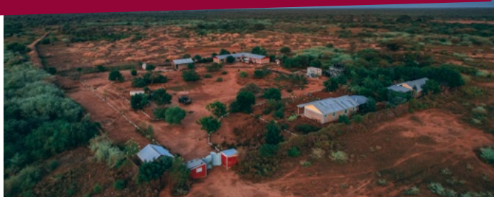
The mission station with the farm in the background.

We received a 250 x 300 metre piece of land from the elders in Naliel. This will be used as a demonstration farm to show the local people how they can make the most from their land, and run business if they want to.