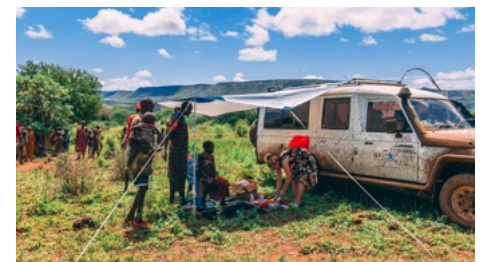
The "treatment room"