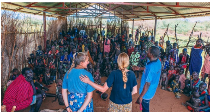
The church meeting for the first time after the persecution ended.