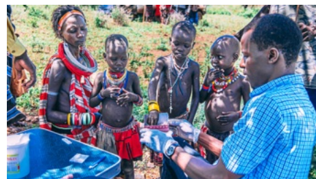
Everyone gets a de-worming treatment