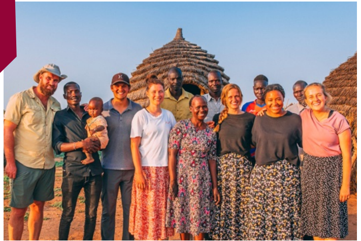
The YWAM F&F South Africa team on outreach with us in South Sudan.