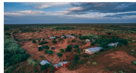
Farm with a prayer garden Next steps for our demo farm