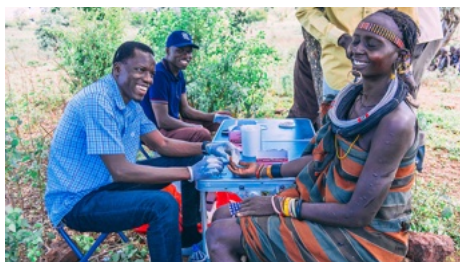
Laboratory under a tree

It was tough going, we were in a tough environment facing many challenges but we were encouraged knowing we were there to demonstrate God's love for these people in this very practical way!