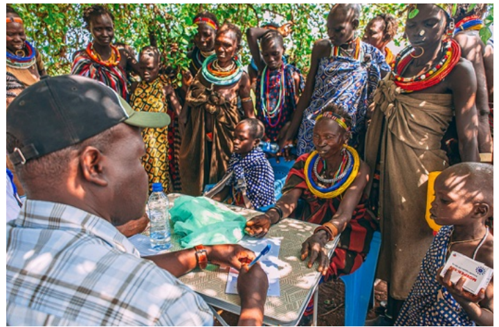
The Dr consultation station

T wo doctors, three nurses, two pharmacy assistants, two laboratory assistants, two pastors and two other staff members. Together we headed north to South Sudan. Most of the team were Kenyans and had never been this far from Eldoret before. We were on the road for three days until we finally reached our station in Naliel.