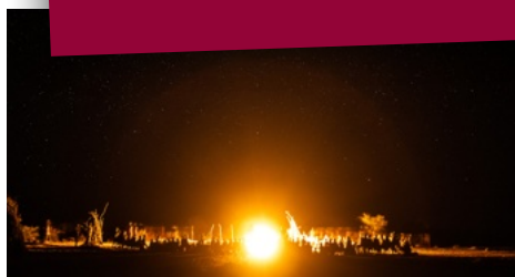
They came to kill... ...but Jesus was might to save.