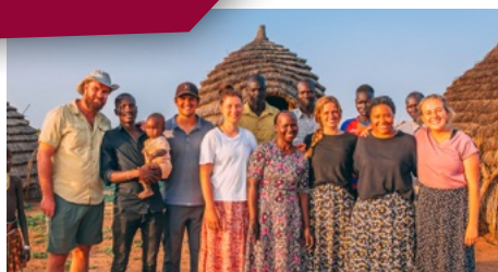
Reaching the lost Testimonies from F&F South Africa