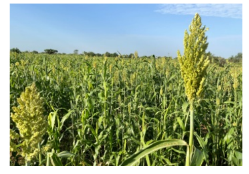
Millet plants in the field