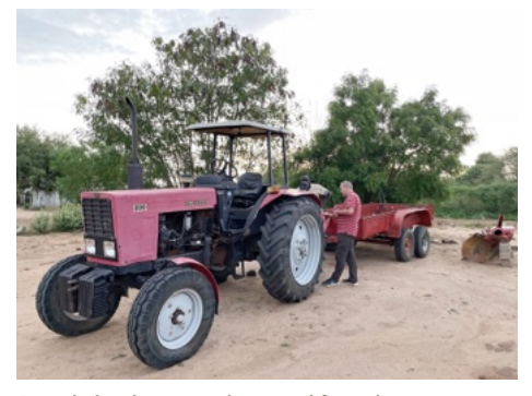
Great help: the tractor borrowed from the mayor