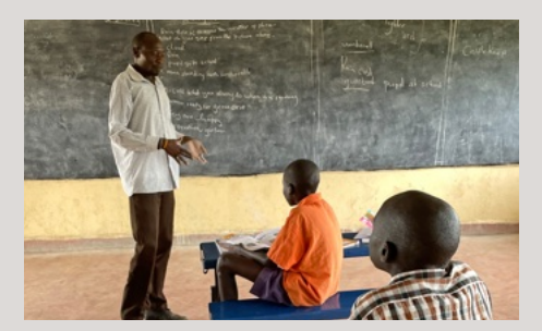
The school now has 150 students