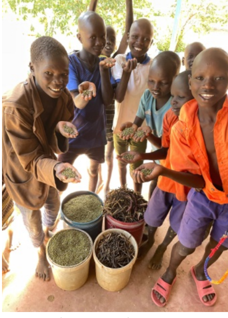
Green Grams (a type of lentils) are very nutritious

In future plantings, we plan to diversify our crops. This agricultural endeavor serves as a gateway, showcasing the local community the wide variety of fruits and vegetables that can thrive in this fertile Sudanese soil. It's a tangible demonstration of the potential of this wonderful land.