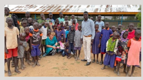
Some of the students and teachers