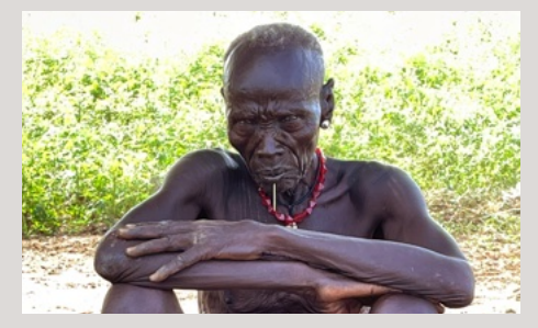
One of the village elders