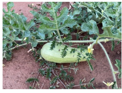
Even watermelons grow on the farmland