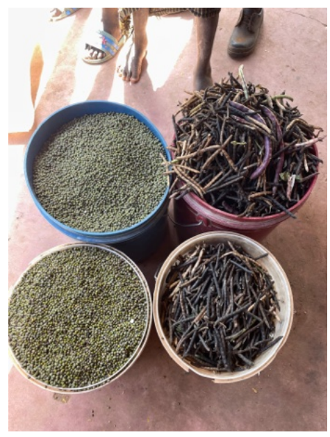
First harvest - and more every day!