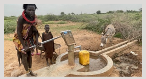
One of the many wells we have drilled and set up in the area