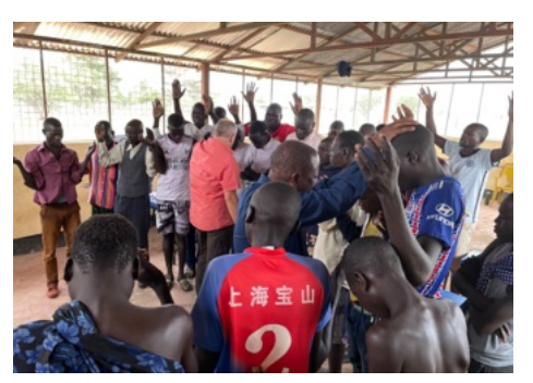
The hunger for more of God's presence is great