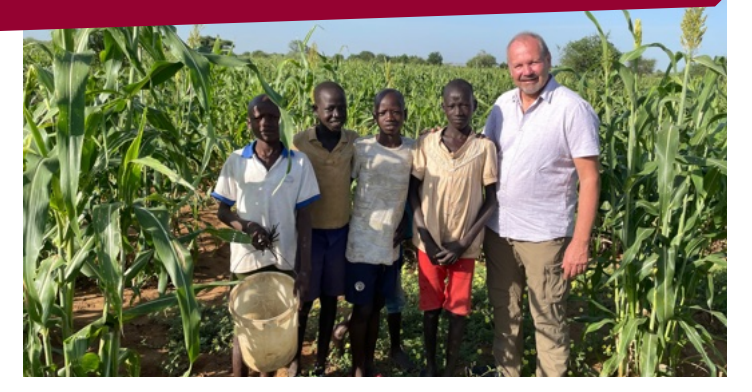
The schoolchildren enthusiastically harvest the first fruit

W ith great enthusiasm, we celebrated the first harvest from a piece of land that, just a few months ago, was overrun with scrub and deemed unusable. Now, it has transformed into fertile farmland, and after only five months, we reaped our initial harvest—a tremendous blessing! Initially, watermelons were harvested, followed by lentils, and now millet, a staple in South Sudan.