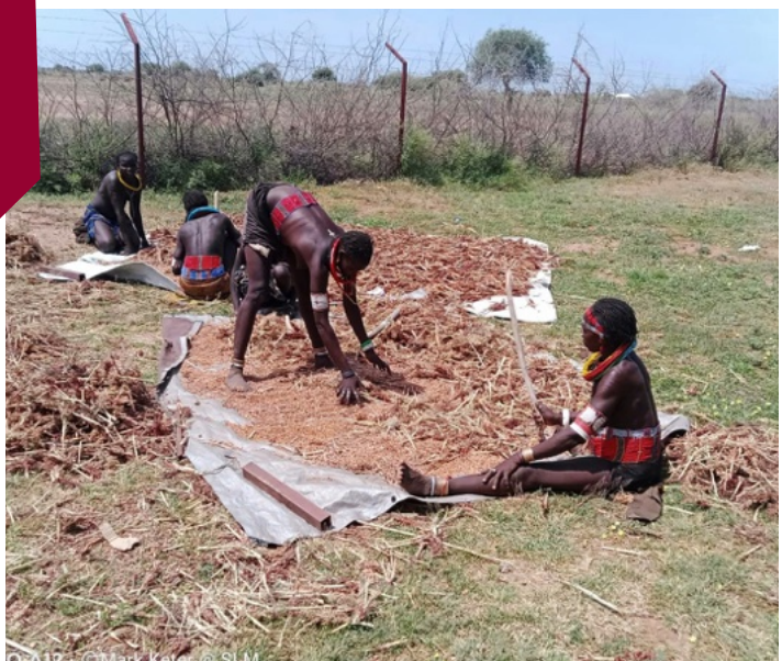
The millet harvest is threshed by hand

This harvest serves a vital purpose, providing breakfast and meals to the schoolchildren. Their joy, along with that of the adults, is palpable. It's astonishing to witness such abundance from land