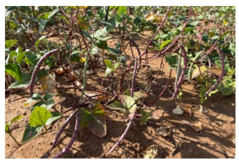
Green Grams Grow on the Bush