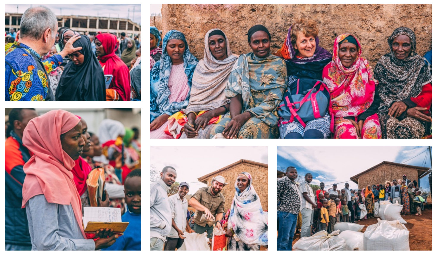
Food distribution amongst IDPs