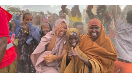
Everyone was wholehearted in worship

journey to Moyale revealed the power of God's transformation and His ability to turn difficult circumstances into opportunities for His grace to shine. mit.