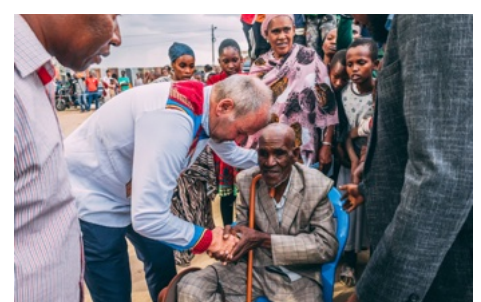
Prayers were said for all people with great needs