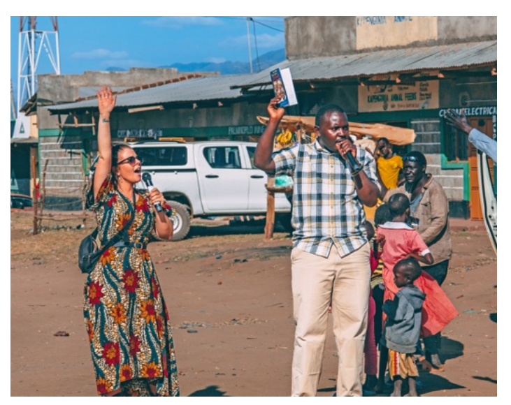
God's word was also proclaimed in the middle of the street