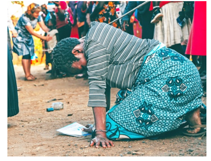
People were touched and prayed earnestly to God

With great determination, these young men discarded their drugs into the barrel, liberating themselves completely. It was awe-inspiring to witness the transformation in their countenance. Their faces radiated a newfound joy, and you could see that something profound had shifted within their hearts. We connected them with a cooperative pastor who would guide them in taking further steps toward recovery and spiritual growth, ensuring that robust follow-up work was in place.