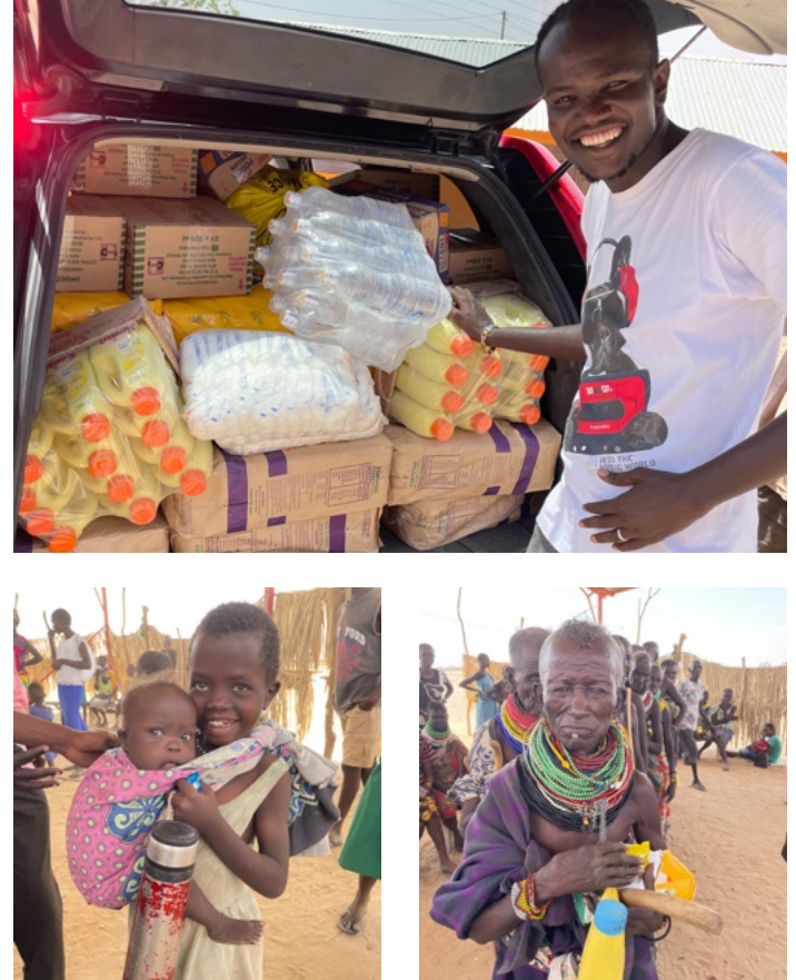
restore order. Our mission to reach the starving population faced a significant roadblock.

Our original plan was to head north to the Turkana region immediately after the crusade in Chepareria for a "hunger relief" mission. However, unforeseen circumstances altered our course. Sudden unrest and political discord erupted between the Turkanas and the Pokot, escalating beyond the typical regional riots and even resulting in the tragic loss of police officers' lives. Consequently, the primary communication route was closed indefinitely, with the Kenyan army deployed to