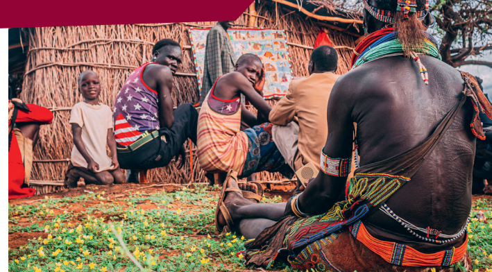
Learning bible stories to go back and share in their own villages.