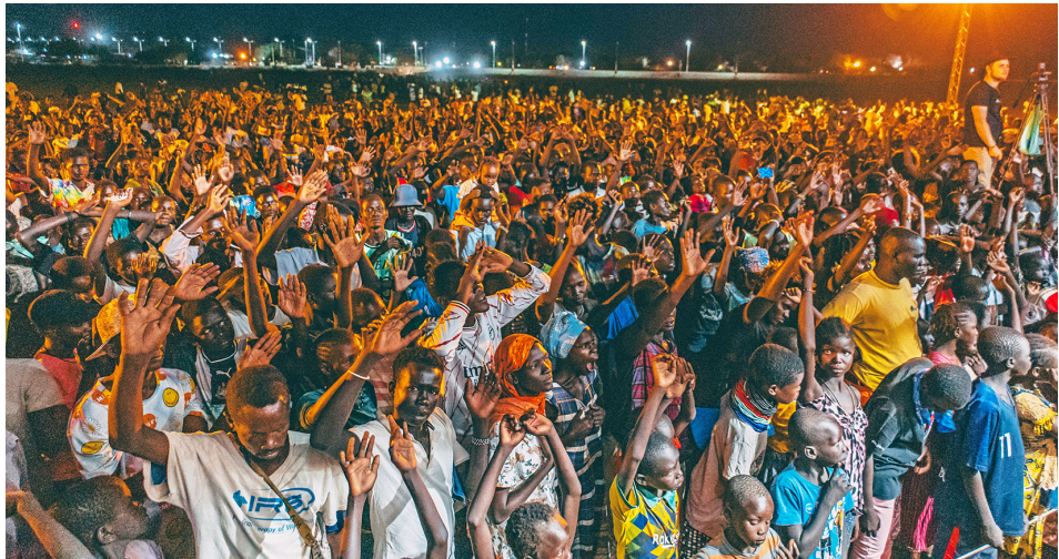
The crowd is coming forward for prayer