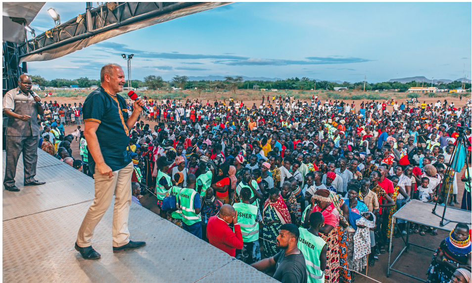
So many coming forward for prayer