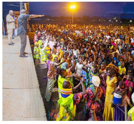
Vielen Menschen zeigten einen großen Hunger noch mehr von Gottes Wort zu hören

On Wednesday afternoon, the main event kicked off, drawing hundreds of people from the town, but also from the camo. Camp one is primarily Somali, Sudanese, and Congolese. The gospel echoed through the children's program, worship, skits, sermons, and prayers. God moved mightily, bringing healing to blindness, nerve disorders, and physical ailments. People were set free, casting away drugs and amulets. Hundreds turned their lives to Jesus, a heartfelt turnaround. Hallelujah!