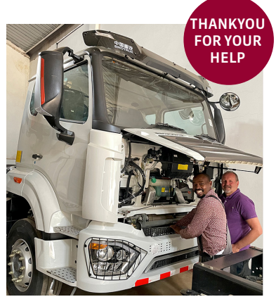
The new Howo Truck