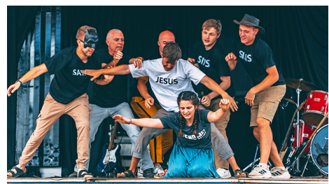
The SIM team acting out a drama on the main stage