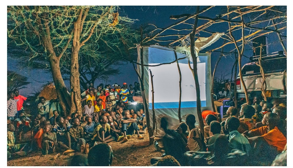
Showing the Jesus film, there are so many people that they watch the film from both sides of the screen.