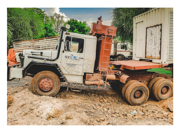
Our old truck has been through a lot.