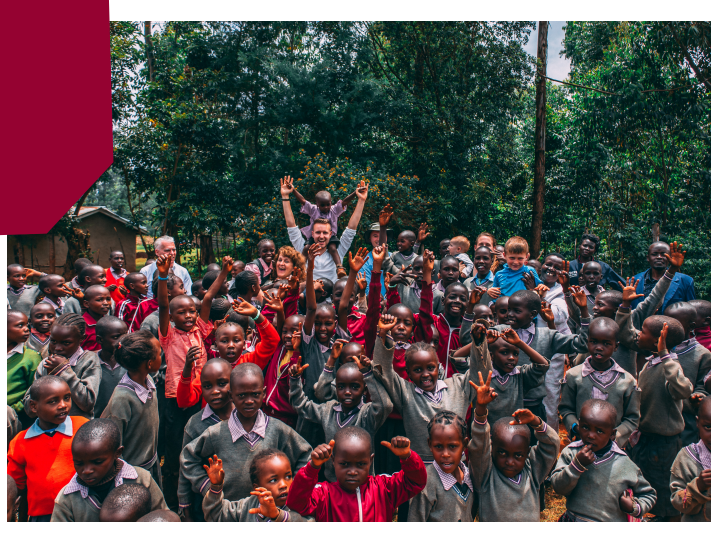
Adventures in the Victory Primary School Yard

very morning, the students of Victory Primary School would arrive at school and check the chores list posted on one of the backboards to see whose turn it was to go and fetch water. Then, in groups of 5-10, accompanied by a teacher, they would embark on the 3km walk to a nearby river and return with one or two jerry cans, each weighing 20-25kg.